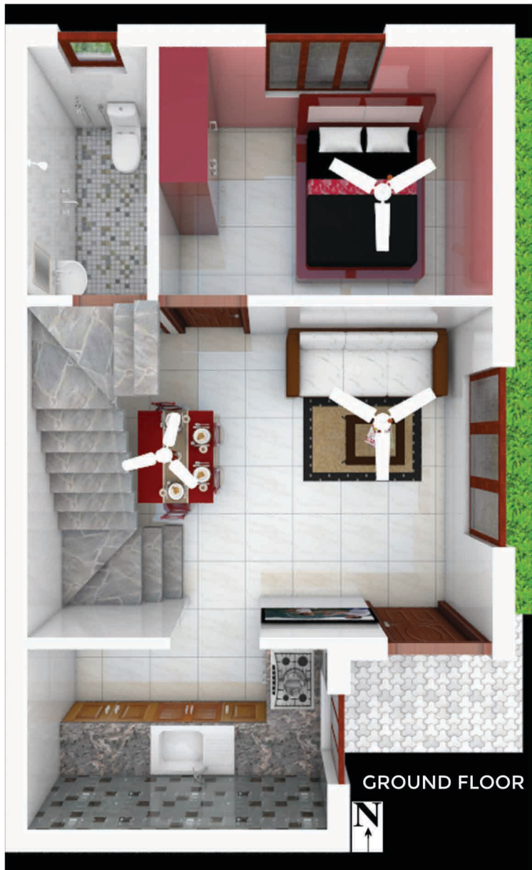
Hall - 15'6"X11'0" | Bedroom - 11'1.5"X8'3" | Kitchen - 10'0"X6'0" | Bathroom - 4'0"X8'3"