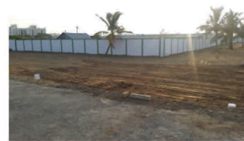
ACTUAL IMAGES OF GOKUL AVENUE