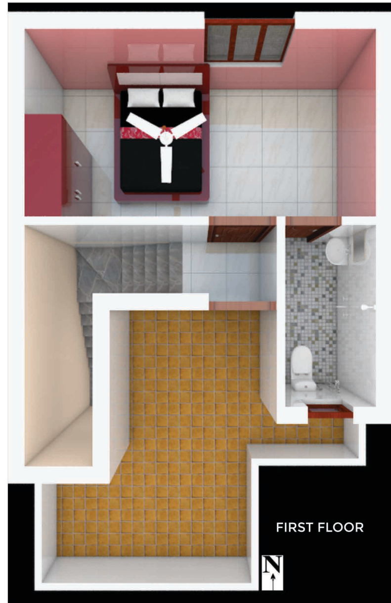
Bedroom - 15'6"X9'3" | Bathroom - 4'0"X8'0"