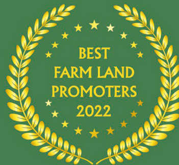
By News 18 Tamilnadu