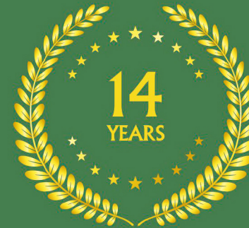
In Real Estate Industry